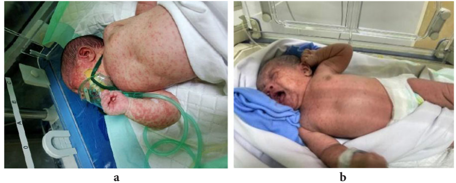
Figure 1. a. First day patient in the Emergency Room; b. Patient after being treated for 5 days in NICU.

This is a case report of neonatal varicella in an infant aged 14 days. The diagnosis is made based on the results of the history, physical examination and supporting examinations in the Tzank test and skin biopsy. The case of neonatal varicella infection in this patient is rare. In Australia, 44 cases of neonatal varicella (1:17,000 pregnancies per year) were recorded in 1995-1997. 8 Based on surveillance data in 2006-2009, the incidence of neonatal varicella is 0.7 per 100,000 live births annually. 9 In a study conducted by Michele Trotta et al., the incidence of congenital varicella syndrome was 1.56%. 10 In this