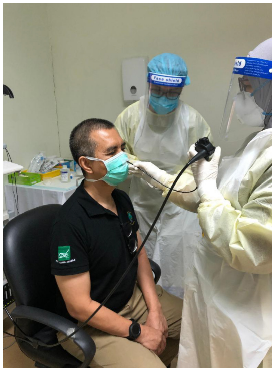
Figure 3. A patient wears a modified surgical mask as an additional barrier help to contain aerosolization during flexible endoscopy in the clinic.

patient and the medical personnel was ensured during transportation. Since a negative pressure room was unavailable, the patient was operated in a standard operating theatre, but the theatre's laminar flow was turned off. The essential monitors such as the electrocardiogram (ECG), pulse oximeter, intravenous access and closed in-line suction tubing were checked thoroughly to prevent the risk of disconnection and spillage of contaminated blood or other fluids. The patient was intubated uneventfully with ETT size 6.0 mm and it was inserted about 2cm deeper than usual.