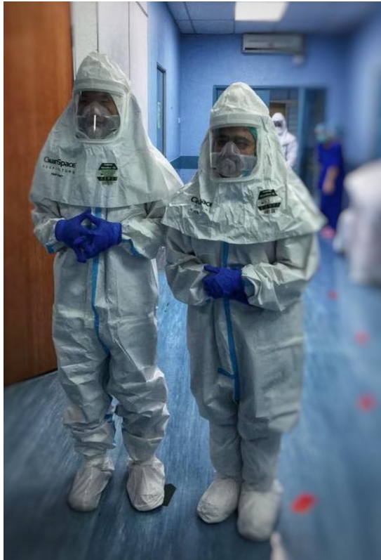
Figure 2. A meticulous donning of enhanced PPE includes PAPR (Halo CleanSpace CS3000) and a Tyvek suit.